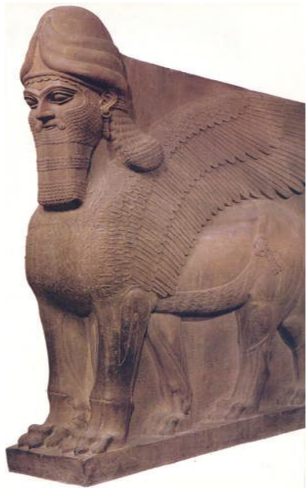
Metropolitan Museum of Art

This 10-foot-high, 9-foot-long limestone colossus weighs more than ten tons. In structures built during Ashurnasirpal’s reign, entrances were guarded by a pair of colossi: generally a human-headed lion and a human-headed bull. This sphinx and its companion are now beautifully displayed in the Metropolitan Museum of Art, in New York.